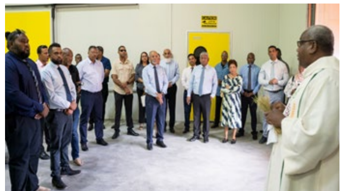
The blessing ceremony in the presence of distinguished guests.