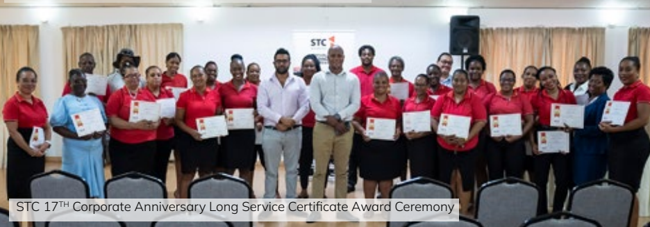
Celebrating our People & Honoring Progress!