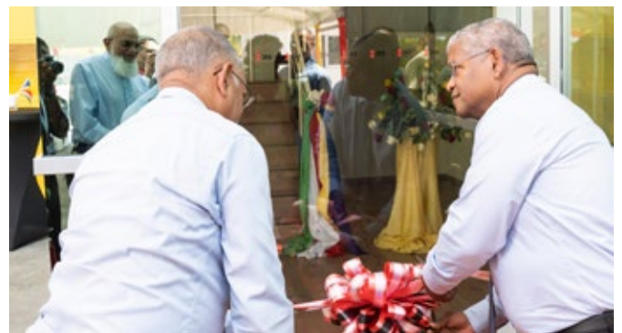
President Wavel Ramkalawan and Vice President Ahmed Afif doing the honor of cutting the ribbon.

STC would like to take this opportunity once again to extend its heartfelt thanks and appreciation to everyone who devoted themselves selflessly to the success of this project, ultimately contributing to the well-being of the Seychellois people.