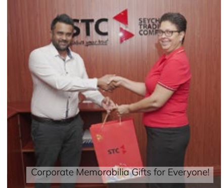
Corporate Memorabilia Gifts for Everyone!